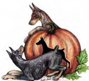
Carve out the Standard DPCA 2012 • Ft. Mitchell, KY