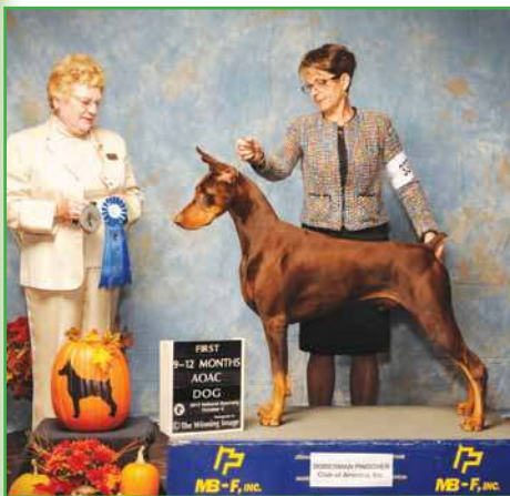
Dog - Puppy 9-12 Mos. AOAC Cha-Rish Follow That Dream A Hallam/K Hallam