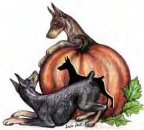
Carve out the Standard DPCA 2012 • Ft. Mitchell, KY