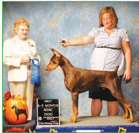
Dog - Puppy 6 - 9 Mos. AOAC Alisaton Seduced By Temptation L Blanchard/T Blanchard/G DeMiita/C DeMiita-Shimpeno/A Thorne