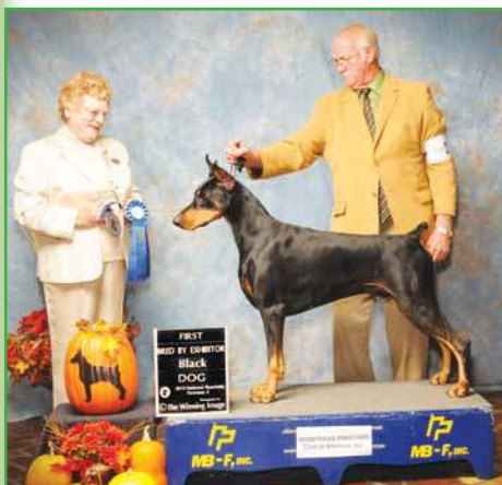
Dog - Bred By Exhibitor BLK Liberator's Hugo Boss P Blenkey/B Casey