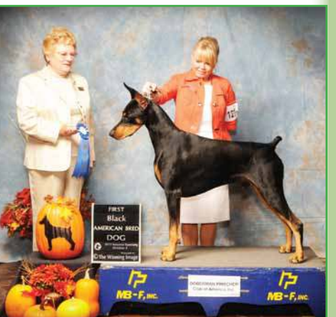
Dog - American Bred BLK Kinetic The Great Whodini S Demko/B Demko