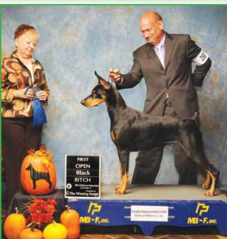
Bitch - Open BLK Caleb's Redemption L Jones