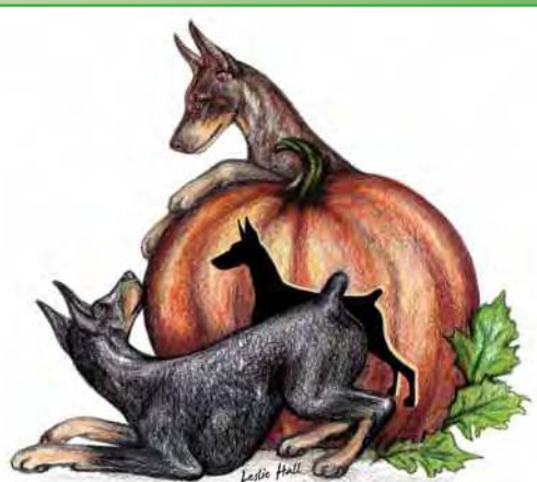
Carve out the Standard DPCA 2012 • Ft. Mitchell, KY