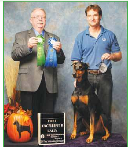
Excellent B MACH5 Fulcer's Raven UDX OM1 RE MXS2 MJS2 XF - L Fulcer