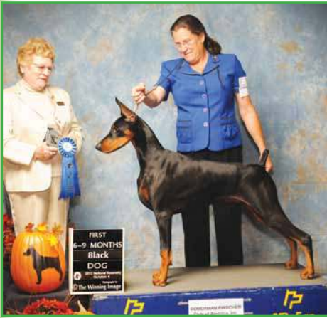
Dog - Puppy 6 - 9 Mos. BLK Alisaton East Of Eden A Thorne/G DeMiita/C DeMiita-Shimpeno