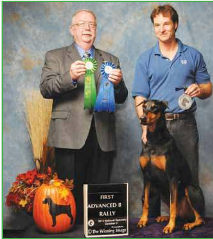
Advanced B MACH5 Fulcer's Raven UDX OM1 RE MXS2 MJS2 XF - L Fulcer