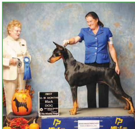
Dog - 12-18 Mos. BLK Belgreys Casey Abrams T Evers/S Gregory