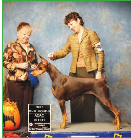
Bitch - 12-18 Mos. AOAC Rauschund's Stacked And Packed S Bruno/B Bruno