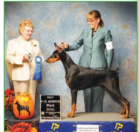
Dog - Puppy 9-12 Mos. BLK Pamelot's Xtraordinary Gentleman P DeHetre