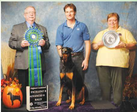
High Combined Rally MACH5 Fulcer's Raven UDX OM1 RE MXS2 MJS2 XF L Fulcer

All win photos & show candid in the National Pipeline were provided by: