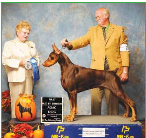
Dog - Bred By Exhibitor AOAC Liberator's Apache Warbonnet B Casey/P Blenkey