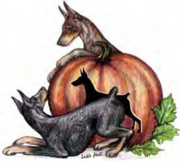
Carve out the Standard DPCA 2012 • Ft. Mitchell, KY